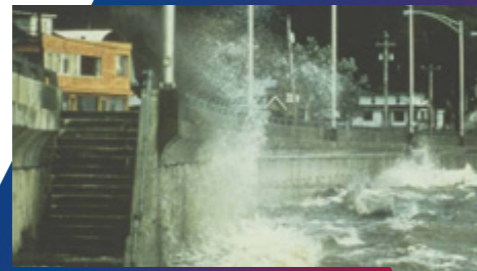
Gaspé peninsula - Quebec, Canada