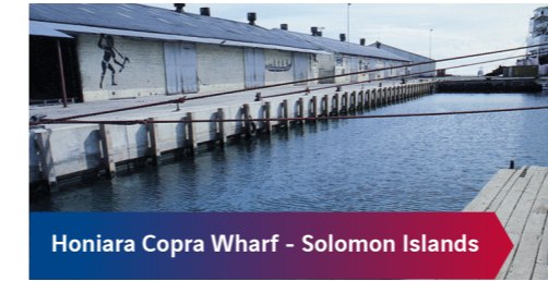
Honiara Copra Wharf - Solomon Islands