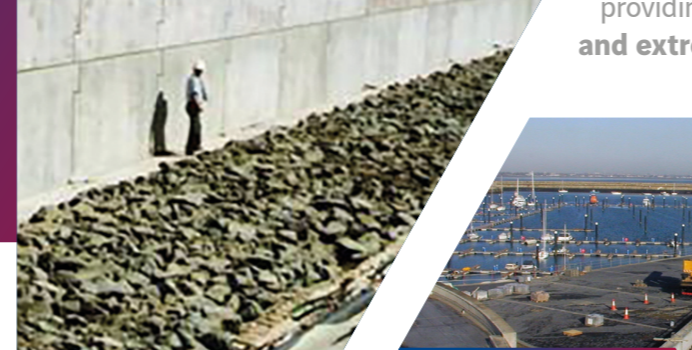
Dun Laoghaire - Ireland

Reinforced Earth® marine structures have generally been constructed under dry condition or during periods of low tides. Experience has proven that structures in sheltered sites or harbors can be submerged during the initial stages of construction without any damage to wall construction.