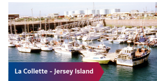
La Collette - Jersey Island

The GeoMega® system can be combined with a waterproofing membrane on the back face of the panels (patent pending). This allows the use of Reinforced Earth® solution for structures which need to be watertight such as dry docks or protection levees against cyclonic storms or sea water surges.