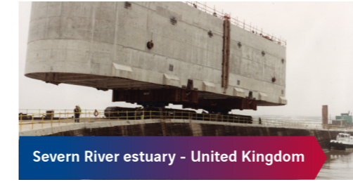
Severn River estuary - United Kingdom