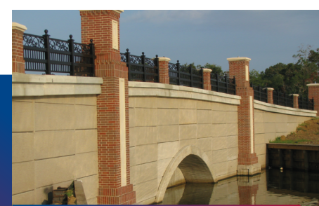
Beacon Island - Galveston, Texas, USA

The Reinforced Earth® technique has been used for around 60 years to build marine structures either on coastlines or in harbors. The design and construction materials used in marine environments must allow for the risks associated with this special environment. Performance characteristics that have made Reinforced Earth® solution universally accepted in traditional civil engineering applications can be easily adapted to the requirements of marine projects.