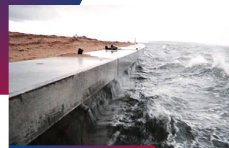
Sydney Airport - Australia

The Reinforced Earth® technique has been used for around 60 years to build marine structures either on coastlines or in harbors. The design and construction materials used in marine environments must allow for the risks associated with this special environment. Performance characteristics that have made Reinforced Earth® solution universally accepted in traditional civil engineering applications can be easily adapted to the requirements of marine projects.