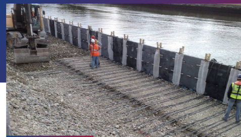
Cork - Ireland