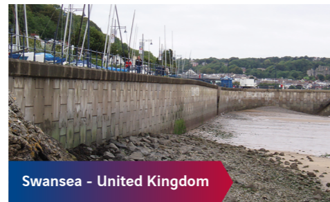
Swansea - United Kingdom

Roads, motorways and railways, are often constructed along the seacoast just above the maximum high tide level. When the seacoast is so narrow that new construction or widening of existing communication link encroach on the sea, retaining structures are required and the Reinforced Earth® technique is perfectly adapted to such applications.