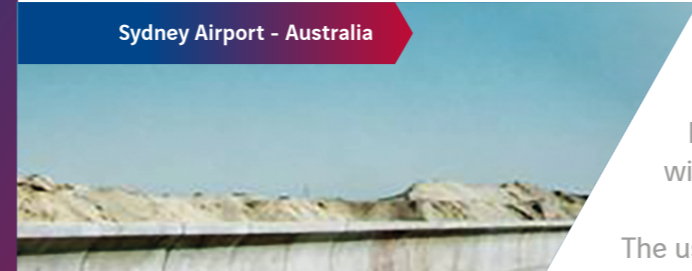
Sydney Airport - Australia